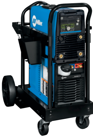
907538002 Maxstar 280 TIGRunner® shown with four bottles of 043810 Low-Conductivity Coolant.

Select desired stock number for each step.