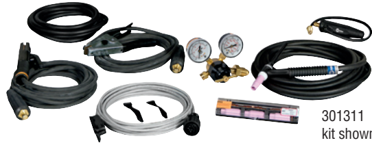
301311 kit shown.