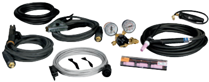
Contractor kit 301311 shown.