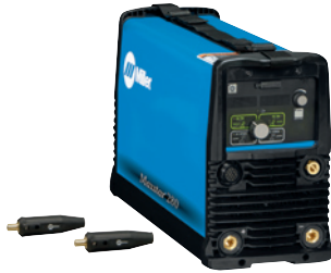
907552 Maxstar shown.

Select desired stock number for each step.