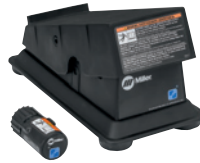
301580 remote shown.