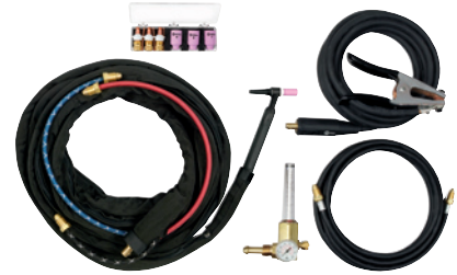
300990 kit shown.